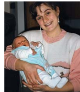
Pope advances case of sainthood for mother of three