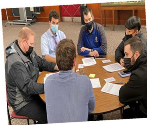
Synodality listening & Walking

The Feast of Pentecost concludes the Easter Season and remembers the descent of the Holy Spirit upon the Apostles and the Blessed Virgin Mary. The day is more than just a commemoration of an event in the history of the Church. It is a celebration of the on-going presence of the Holy Spirit in the life of the Church. The Holy Spirit enlivens the Church, invigorating her and giving her the impetus to continue to