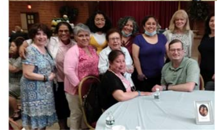
PS members enjoy the gathering at O.L. of Trust celebration