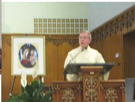
Below: Adoration of the Blessed Sacrament at St. Kevin's as PS members honor Our Lady of Trust, Patroness of the Pro Sanctity Movement.