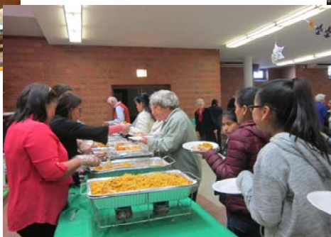
Below left and center: No PS celebration is complete without the sharing of good food and good conversation with friends.